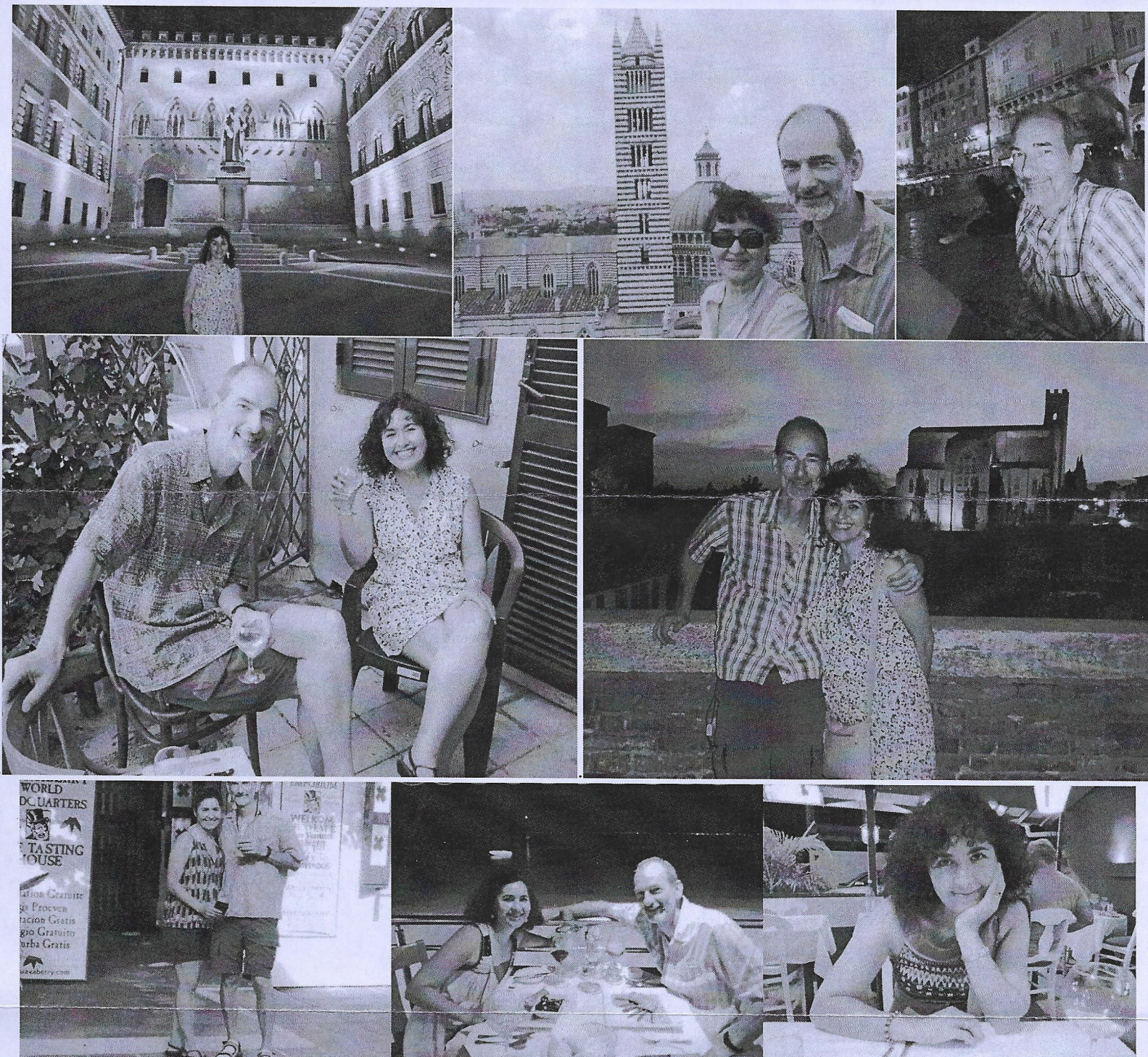
Siena, Rome, St Martin

Our annual news is on the christmas card section of our website with better photo viewing. Send us an email and we will respond. Promise.